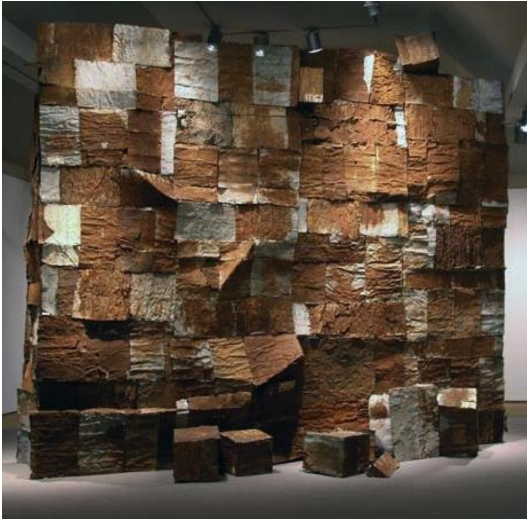
Figure.4: El Anatsui Crumbling Wall 2000 – found objects, copper wire.

This adverse impact of Western influence on developing countries through economic oppression and exploitation constitute the main themes of Eke's works. Having experienced what, he described as acid rain working in Port Harcourt Nigeria, it instigated his questioning of Western exploitation in contemporary Nigeria by European companies. Eke uses water, strings, plastic bottles, old metal plates, discarded cellophane bags etc., as his preferred medium, to question environmental destruction, negligence, domination and ecological devastation (Matthews 2009). On the inspiration behind his appropriation of mundane objects for contemporary art expressionism, Eke recounts that,