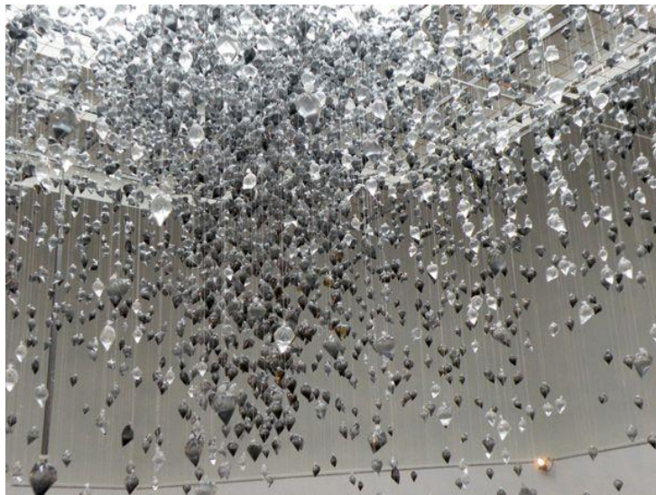
Figure.5: Bright Ugochukwu Eke Acid Rain 2005 (Source: Okwuosa, Tobenna 2013).

This experienced resulted in the creation of his installation Acid Rain 2005 (fig.5), a conceptual installation of acidified water, in discarded plastic bags, installed hanging from tree branches and gallery roofs as a metaphoric visualization of the problematized living condition of the inhabitants of the Niger Delta region (Okwuosa 2013).