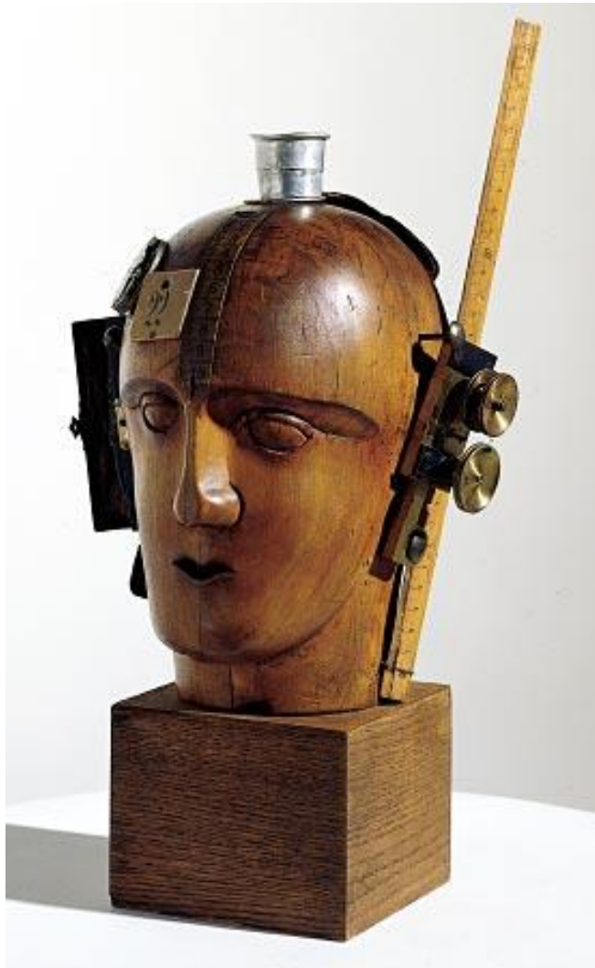
Figure. 1.: Raoul Hausmann Mechanical Head 1918 ( The Spirit of Our Time ), assemblage circa. (Source: Patrick Bade, Joseph Manca, Sarah Costello).

The Czech born Dadaist Raoul Hausmann, used object construction and collage for political protest, contesting the excessive control of German capitalist forces, and the loss of the self to machines as evident in his Mechanical Head 1918 (Figure.1).