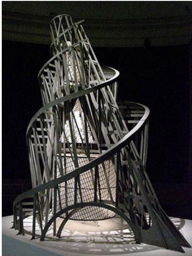
Figure 1.6: Vladimir Tatlin's Model for the Monument to the Third International 1920 ..

Vladimir Tatlin of the Russian avant-garde believed in the use of Found Object for socio-political protest against social power in order to transform modern society. His Model for the Monument to the Third International 1920 , etc., (fig.2) reflect his use of inartistic, unconventional materials to challenge and subvert the political hierarchy, by producing anti-art forms opposed to the artistic and culturally accepted conventions determined by the ruling class.