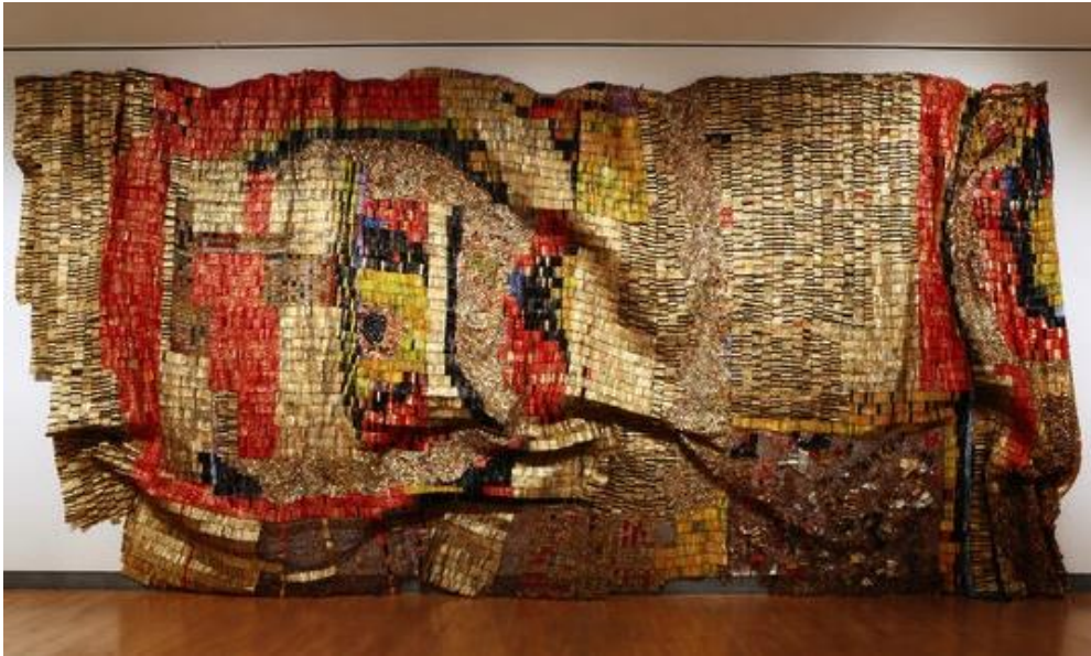
Figure.3: El Anatsui Earth's Skin 2007 – found object aluminium bottle caps (Source: Brooklyn Museum).

Anatsui's use of flimsy ephemeral and discarded objects makes visual references to the frailty, uncertainty and fragmented state of postcolonial Nigeria/ Africa damaged by colonialism and colonial thinking on which modern politics/ governance in Africa are based. This appropriation of discarded objects to proselytize political and socio-environmental views, defines the political inclination and imperatives of his art and his overwhelming influence at the University of Nigeria Nsukka, inspired many Nigerian/ African artists to pursue same revolutionary ideologies and creative ethos which manifest in their art practices till date.