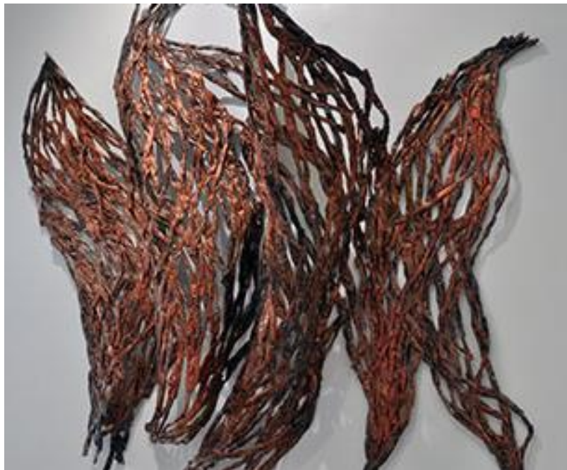
Figure.10: Nnenna Okore No Condition is Permanent 2013.

interrogates the consumerism culture and lack of recycling in Nigeria/Africa and uses her works to enlighten the public on the adversities of uncontrolled generation and dumping of waste. Beyond this cultural concern of her immediate society, her recent works as a diaspora artist, explores materiality of objects. Works such as No Condition is Permanent 2013, Age Lessons 2011, Dry Season 2009 etc., (Figure. 10) captures Okore's appropriation of discarded objects and waste in unique creative formalism for social commentary on Africa, to promote urban societal sustainability.