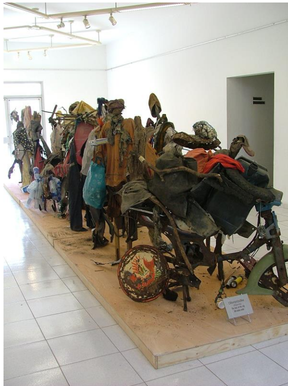
Figure.8: Dilomprizulike The Face of the City (Source: ArtCo 2010).

activity or the other typical of everyday hustling that defines Nigerian cities like Lagos. But significantly, all the figures are created through the assemblage of varieties of discarded objects – old jute bags, clothes, plates, tires, metal sheets/rods, plastic bottles, and paper bags etc., generated from the city. By constructing his many subjects and the city with discarded objects in this installation, the artist questions the degradation of postcolonial cities by the rising problem of indiscriminate waste generation and dumping in Africa (Figure.8).