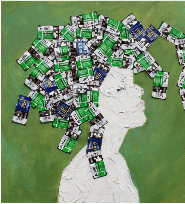
Figure.7: Taiye Idahor Change of Name 2012.