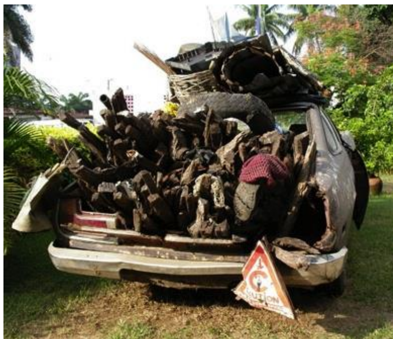
Figure. 9: Dilomprizulike. Journey Out of Africa 2005.

Africa 2005' is radically political and impactful. The extensive installation comprises of an old car filled with a plethora of discarded objects – old metal, plates, cloth, wood, cans etc., to the point of overflow. The car is then driven down town with the boot open, and garbage strapped to the its roof, allowing some waste objects to drop along the way; this performance installation captures the effect of Africa's materialistic culture and Western economic domination. The piece comments on the saturation of Africa with Western waste and how the transformation of Africa into a dumping ground has resulted in the displacement of indigenous peoples alienating them from their communities and forcing them away from the continent into foreign lands as refugees as a result of neo-imperialism (Figure.9).